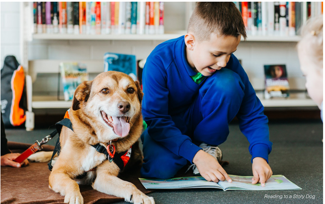
Reading to a Story Dog