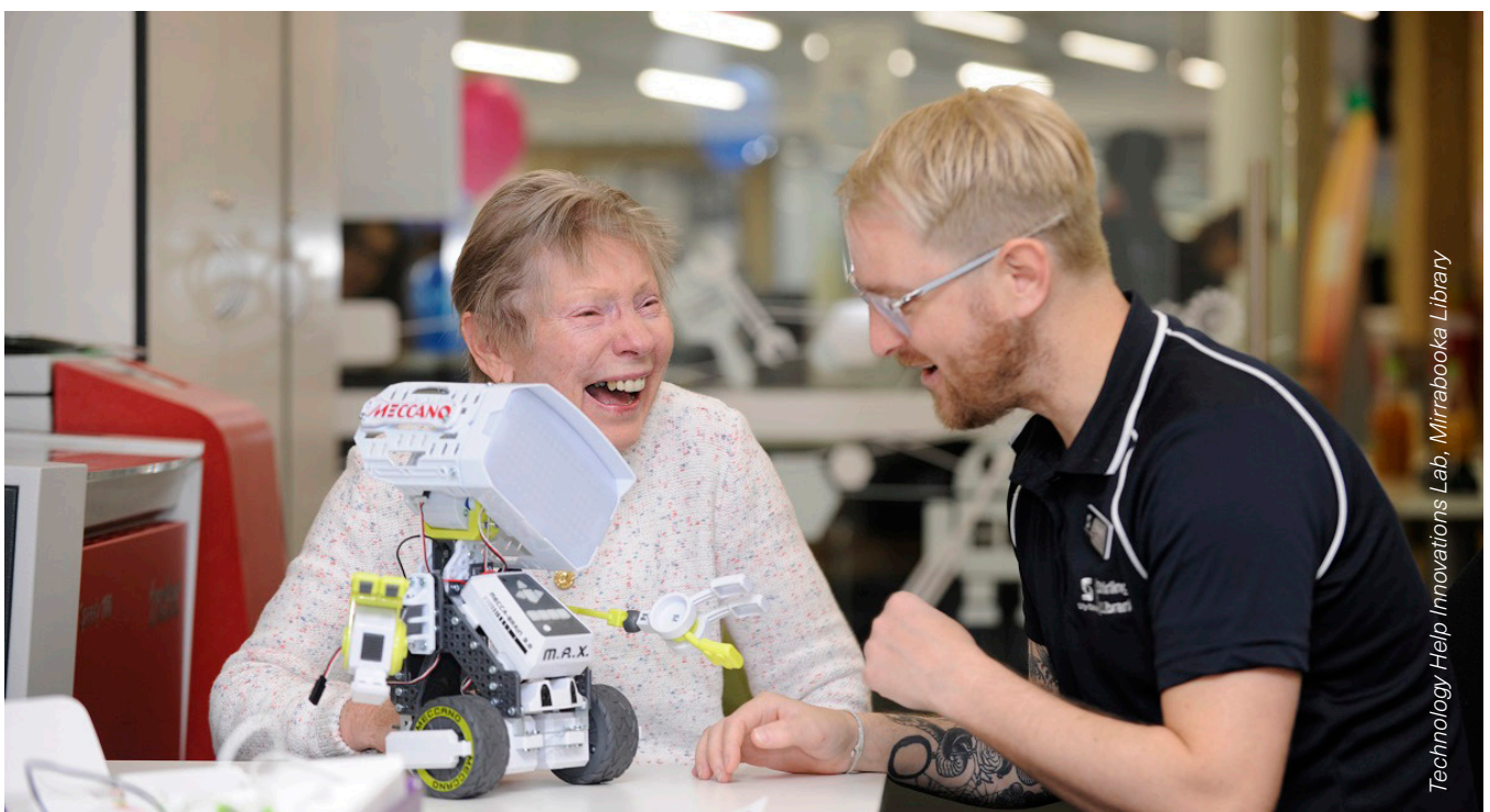
Technology Help Innovations Lab, Mirrabooka Library

This Public Library Services Agreement may only be modified during the life of the Agreement with the written consent of both parties.